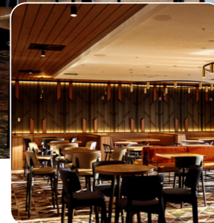
Hillside Lounge Bookable Space

Get in touch today via: savyballoons@gmail.com hello@bowersandflowers.com.au