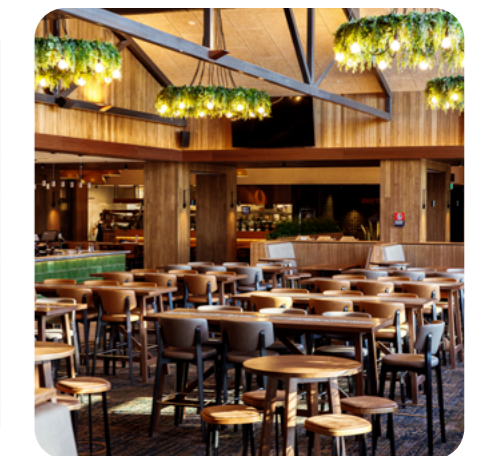
The Manor Walk-In Space