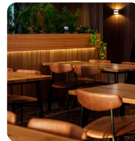
The Grove Walk-In Space