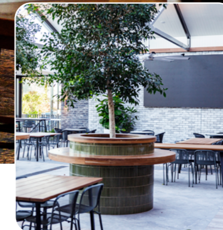
The Mezzanine Bookable Space